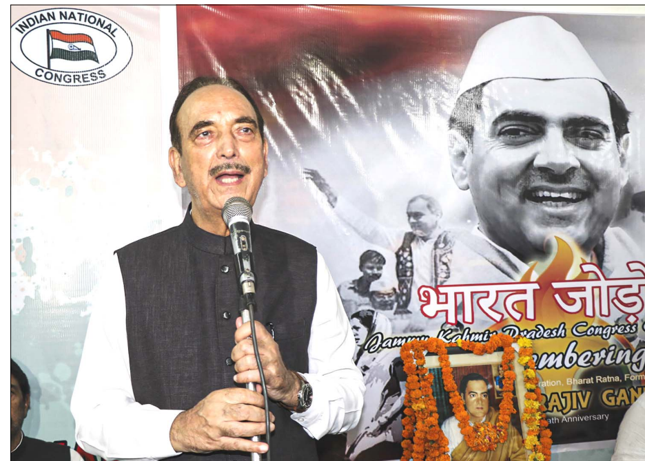
Congress leader Ghulam Nabi Azad addresses party workers at a programme to pay tribute to former Prime Minister Rajiv Gandhi on his death anniversary, in Jammu

Azad made the assertion, reiterating his stand on the Delimitation Commission report, saying that the tailor-made report is in contradiction with the ground realities. Azad, the J&K former chief minister, called for united efforts to finish militancy and also urged the government to accept the genuine demands of vulnerable sections of the society to ensure that they are not put in harm's way. The government should not be happy over the increase in tourist arrivals (in Kashmir) and link it with the (improved) situation, he said. I give full credit for the tourism boom to the almighty as the rising temperatures in Delhi and the rest of the country prompted people to look for cooler environs in Kashmir, Shimla and elsewhere, Azad told reporters here. Azad reached Jammu on a two-day visit and presided over a function at the party headquarters to pay tributes to former Prime Minister Rajiv Gandhi on